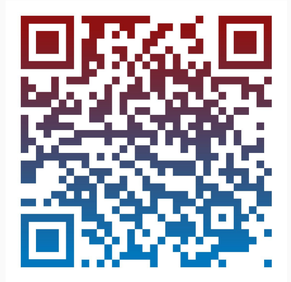
QR Code for Individual Grants Page